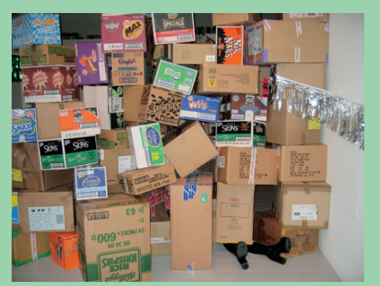
Car Stereo Parkway 2005 Transmission Gallery, Glasgow