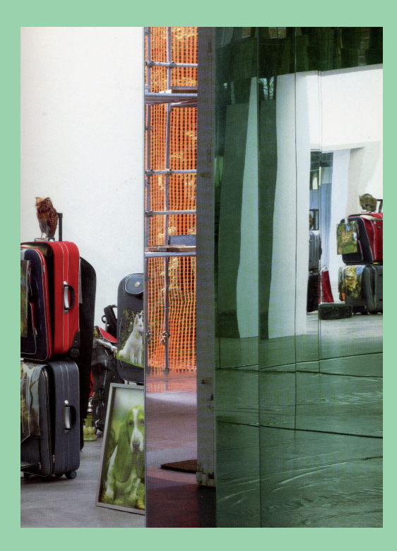
Isa Genzken Oil

happened is the "culture industry," which brings us—in the CliffsNotes version—to Andy Warhol, Harrison's other omnipresent precursor. What Harrison knows with Duchamp is that the house of cards of capital-A art is just that; what she learns from Andy is that there is no experience of the world today outside the ruses of the publicity machine. Neither lesson implies that a measure of old-fashioned, pre-Duchampian, autonomous art does not circulate in the virtual ocean of our modern-day reality. The old forms have hardly vanished; they linger, exert pressure—as popular perception, as institutional apparatus, as habit of mind or, more positively, tradition. They just mean differently (because we know what that phantasm of Art consists in), and the way they mean, it seems to me, is rather craftily captured in Harrison's pedestal game.