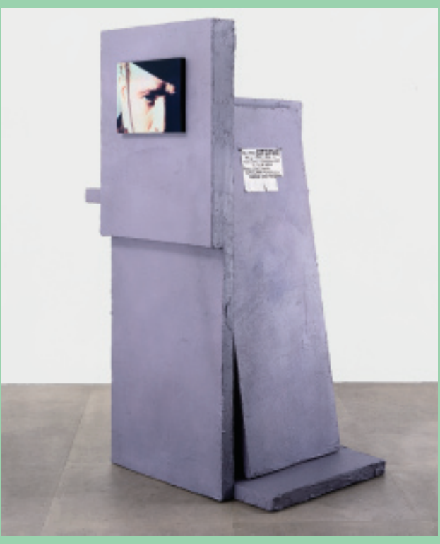
The Honey Collector