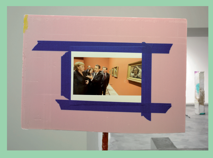
Mustard and Ketchup 2008 (detail)

motivated by his frustration with the institutions of bourgeois art (and his rough handling at the Salon des Indépendants of 1912), if he fully intended to leave the art object behind—both its defining autonomy and the retinal surplus that autonomy permitted—Harrison is happy to keep the "Art" in the picture. Indeed, her work admits the whole universe of retinal and plastic play Duchamp's cerebral theater disavowed, and "sculpture," its old-fashioned conventions, supplies a kind of syntactical base unit for her project, though given the way she torments and teases her totems, knocks the sculpture off its pedestal only to put it back on top, the spirit of her precursor never seems completely absent.