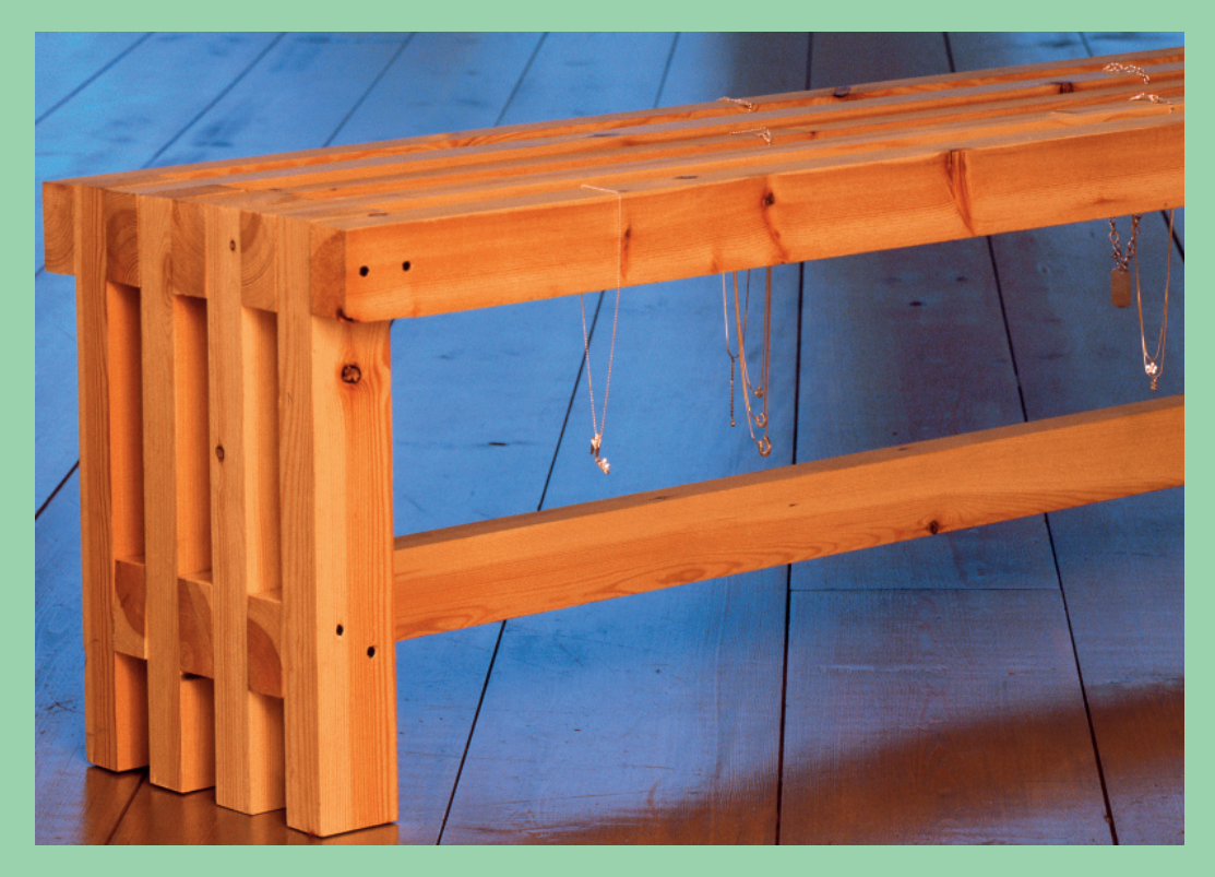
Ringo 2004 (detail)