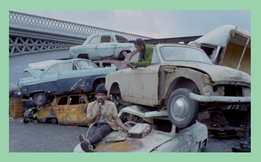
Jean-Luc Godard Sympathy for the Devil

is dissected. It appears rather in poetic, epiphanic moments—structurally mirrored at a formal level—that reveal, often comically, the economic networks that undergird our cultural doings. Think again of the air-freshening cans or her signal The Honey Collector , a 2002 sculpture that did for squeeze-bear honey what Car Stereo Parkway did for canned air. A Flintstones-primitive display shelf arrayed with near-identical (and presumably competing) squeeze honey bears makes us laugh out loud at the market-induced mutation whereby honey—generally and not just a particular brand!—comes in bears. But it's on the flipside of this piece—one of my personal favorites—that things get interesting. Posted on a tilted slab surfaced, like the rest of the piece, in what looks like rough-trowel concrete is a handmade flier advertising the services of a "reliable CAT-SITTER" with "reasonable rates and excellent references," complete with a row of tear-off phone numbers for interested customers. Here we get two economies: that of the mass-produced food industry and that of a DIY system controlled by early teens and urban widows. Oh yes, the third side of the sculpture features a detail of Marlon Brando's face, an inscrutable reference that nonetheless typifies the presiding role of celebrity culture in Harrison's art.