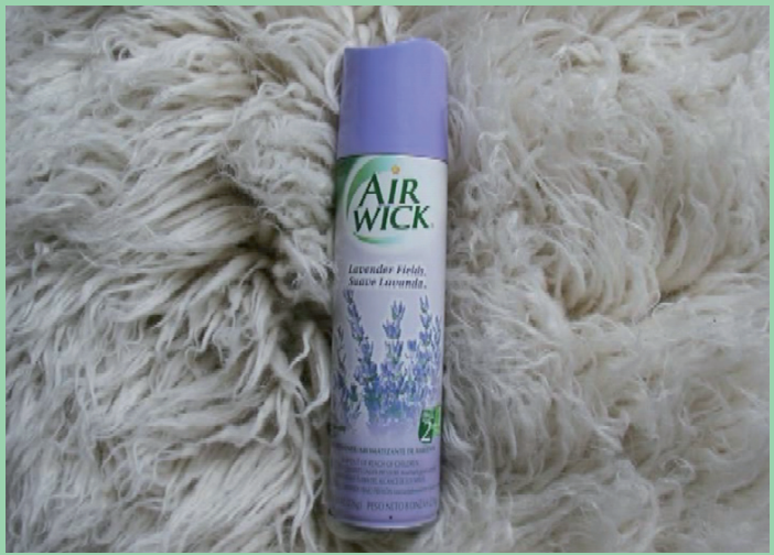
Marcel Duchamp Air de Paris 1919 / 1939