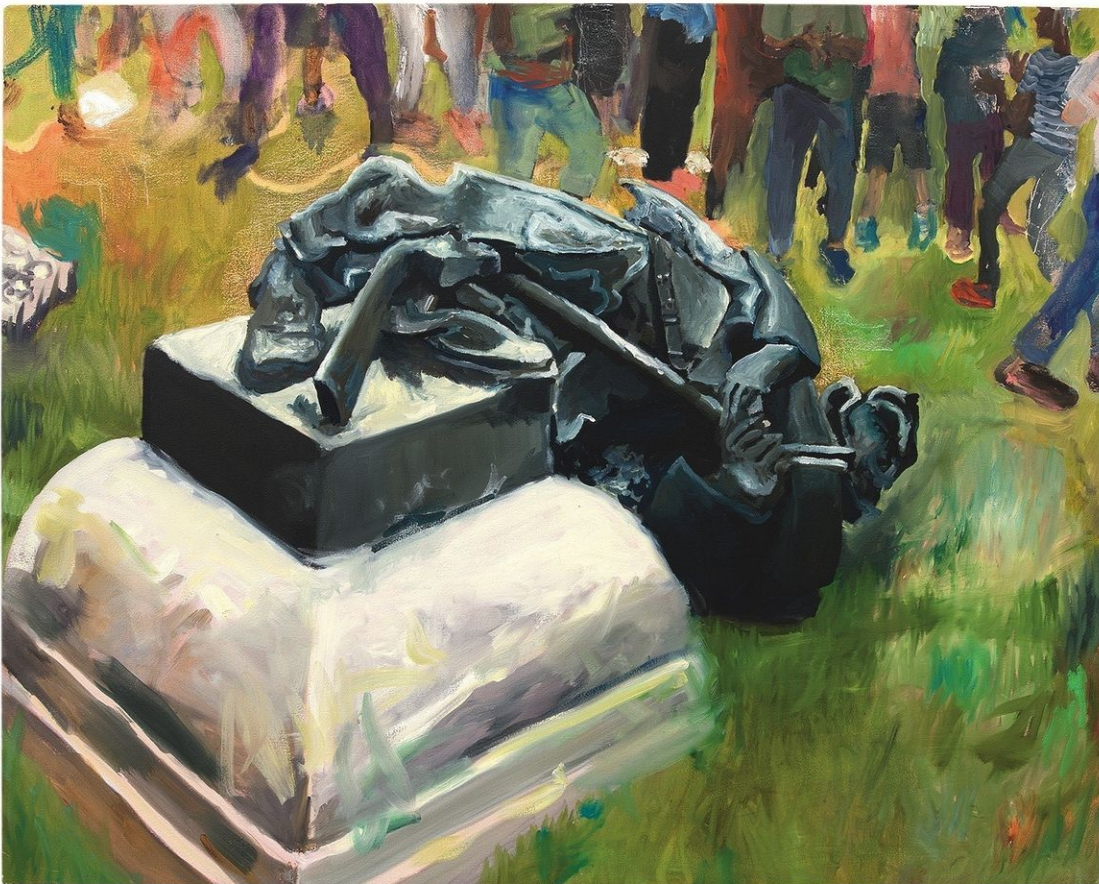
Celeste Dupuy-Spencer, "Durham, August 14, 2017," 2017. Oil on canvas (UCLA Hammer Museum)

A charming grunge imbues Celeste Dupuy-Spencer's clotted pictures — a toppled Confederate statue crumpled like a corpse; a crude man anxiously reading a love letter; smokers indulging their simple, deadly pleasure while idling in a car parked in a trash-filled alley; and, a tightly clustered crowd drowning in a turbulent sea, unable to grasp a nearby lifeline, its arabesque almost decoratively baroque. The quirky paintings, touchingly civilized, are a gentle but firm avowal of humanity during extraordinarily trying times.