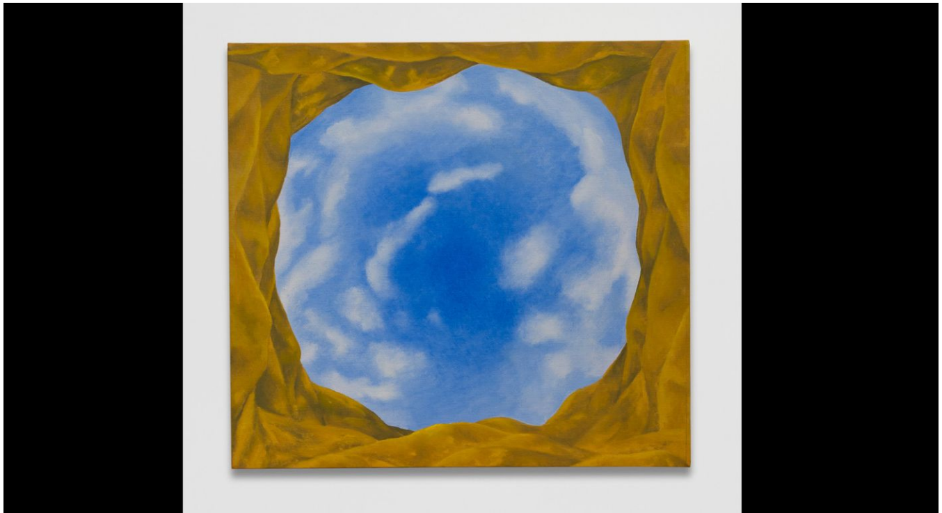
Luchita Hurtado, "Untitled," circa 1976, oil on canvas (UCLA Hammer Museum)