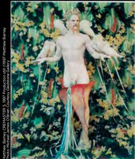
Matthew Barney CREMASTER 5, 1997 Production still

Program A: Cremaster 1 & 2 Program B: Cremaster 3 Program C: Cremaster 4 & 5 + De Lama Lamina