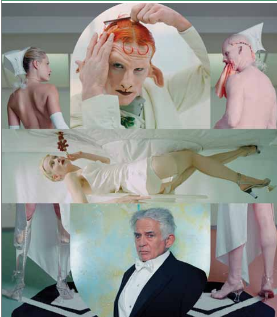
Matthew Barney's THE CREMASTER CYCLE