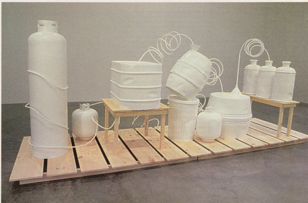
△ Big Still, 2001, Mixed Media

on. It's a fortune to have that base to draw on, as soon as I use my chalkboards, all of those things are already applied. So let's say I draw something like a roller coaster and it has a certain kind of political charge to it, but at the same time all of us have a recollection of going to amusement parks as children and so other things come into play as well.