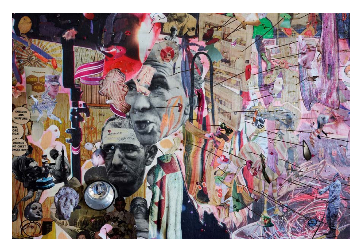
Detail of Hundley's The Plague, 2016. Art: Elliott Hundley/Regen Projects and Kasmin Gallery.

"I don't see a difference between functional art and fine art," says Hundley, a multidisciplinary artist whose practice encompasses painting, drawing, sculpture, photography, and, more recently, forays into furniture design. "Function is just another layer of meaning," he continues. "Functionality is a way to create interaction, and I'm always interested in interaction and ways of integrating aesthetic experiences into our daily lives."