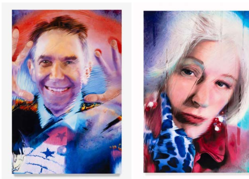
(Left) Marilyn Minter, Jeff Koons , 2024, Enamel on metal, Artwork Dimensions: 72 x 48 x 2 inches (182.9 x 121.9 x 5.1 cm) © Marilyn Minter Courtesy the artist and Regen Projects, Los Angeles.