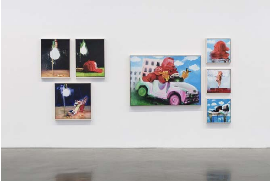
Installation view, Regen Projects Los Angeles

Born in Shreveport, Louisiana in 1948, Minter has spent decades perfecting her singular process and dismantling cultural binaries with a sly, feminist wit. Her résumé reads like a who's who of contemporary art institutions, from the MoMA to the Tate Modern, the Guggenheim, and the Brooklyn Museum, and her accolades, including the 2025 Tribeca Festival x CHANEL Artist Award, attest to her enduring relevance.