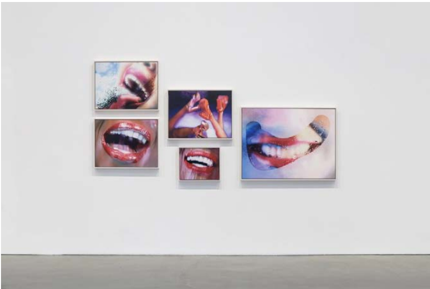
Installation view, Regen Projects Los Angeles © Marilyn Minter – Photo: Evan Bedford Courtesy the artist and Regen Projects, Los Angeles.