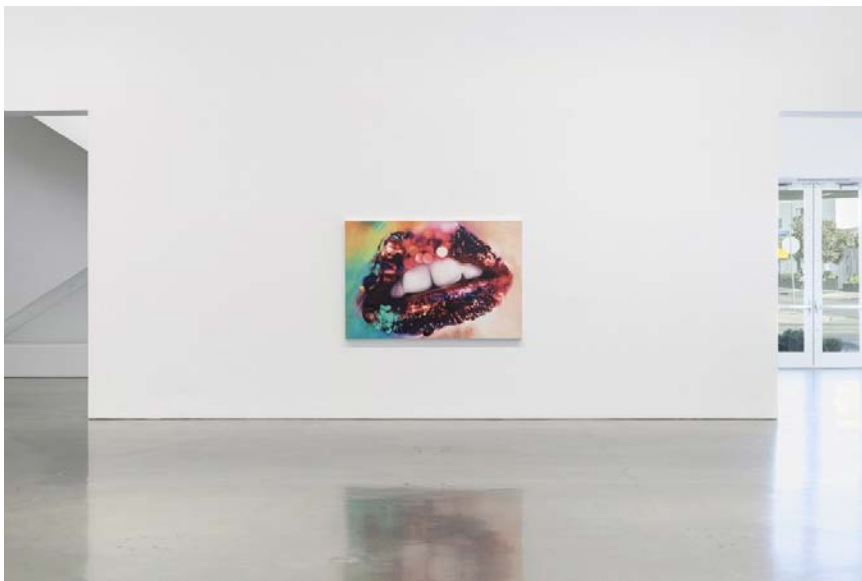
Installation view, Regen Projects Los Angeles © Marilyn Minter – Photo: Evan Bedford Courtesy the artist and Regen Projects, Los Angeles.

The exhibition's Odalisque series takes this tension to a more explicitly political space. The odalisque, that perennial art-historical fantasy of the reclining nude, is recast through the lens of Lizzo and Padma Lakshmi, women who are not muses but authors of their own image. In Lizzo Odalisque (2023–25) , the pop star reclines in heels and lingerie, iPhone in hand, her YITTY logo gleaming from a heavy gold chain. The device replaces the mirror or fan of classical compositions, signaling self-ownership and digital agency in the age of the selfie. Lakshmi, meanwhile, sits upright, biting into an orange amid a decadent still life of fruit and smashed cake along with a tableau that collapses centuries of art history into one assertive, delicious gesture.