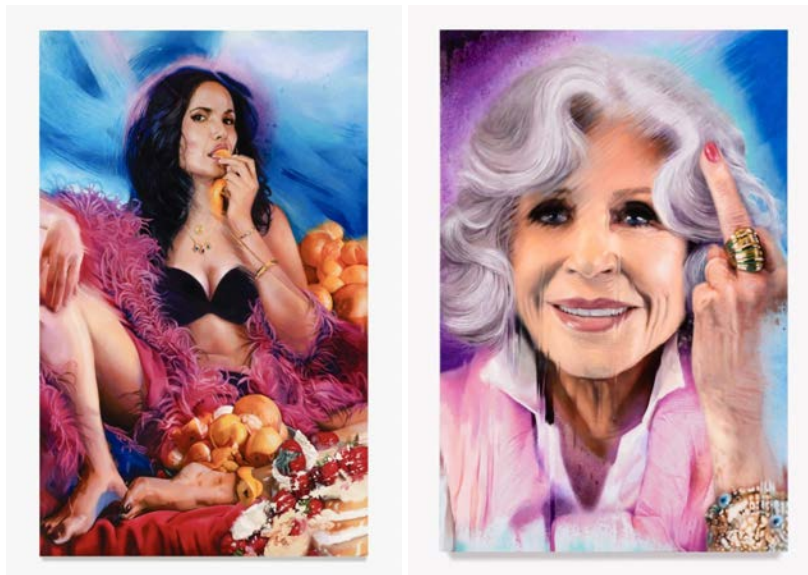
(Left) Marilyn Minter, Padma Odalisque , 2024, Enamel on metal, Artwork Dimensions: 96 x 60 x 1 inches (243.8 x 152.4 x 2.5 cm) © Marilyn Minter Courtesy the artist and Regen Projects, Los Angeles.