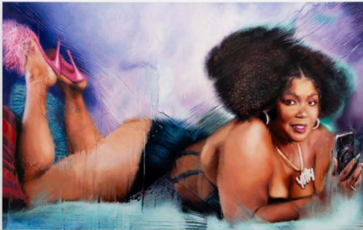
Marilyn Minter, Lizzo Odalisque, 2023–2025, Enamel on metal Artwork, Dimensions: 60 x 96 x 2 inches (152.4 x 243.8 x 5.1 cm) MM 801

Minter, known for her hyperreal enamel paintings that oscillate between glamour and grime, turns her lens this time toward icons Nick Cave, Jane Fonda, Cindy Sherman, and Jeff Koons. Rendered with a crystalline precision that feels almost devotional. Yet beneath the glossy finish lies a defiant looseness. Sherman, the eternal shape-shifter, is identified by a single leopard-print glove; Fonda glows with the heat of a life lived in protest; Cave dances mid-frame; and Koons, with manic energy, presses up against the picture plane as if trying to escape it. Each portrait pulses with a kind of friction. A space between polish and play, control and chaos.